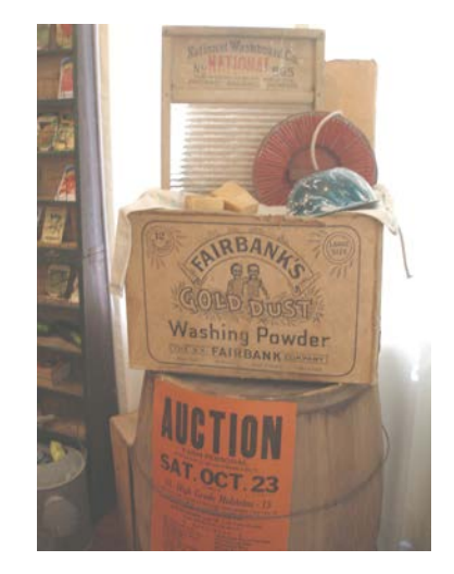
Fairbanks Washing Powder

The Gold Dust Twins trademark for Fairbank's Gold Dust Washing Powder (an all-purpose cleaning agent first introduced in the late 1880s) appeared in printed media as early as 1892. "Goldie" and "Dusty," the original Gold Dust twins, were often shown doing household chores together. In general use since, the term has had popular use as a nickname on several occasions. It is often used to describe two talented individuals working closely together for a common goal, especially in sports.