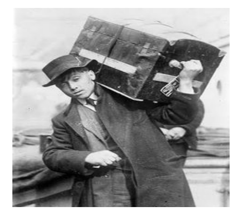
Immigrants Coming to America